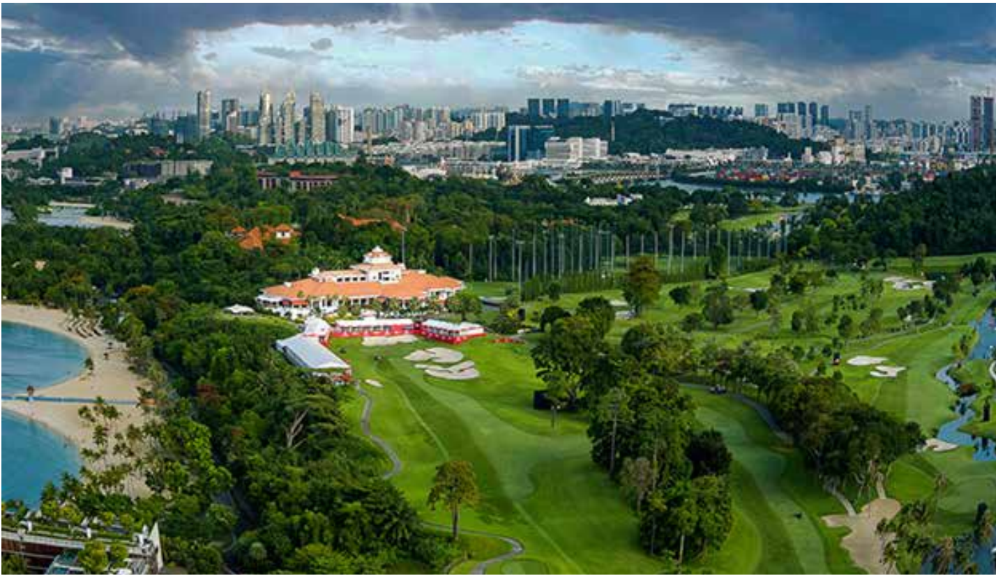
Sentosa Golf Club