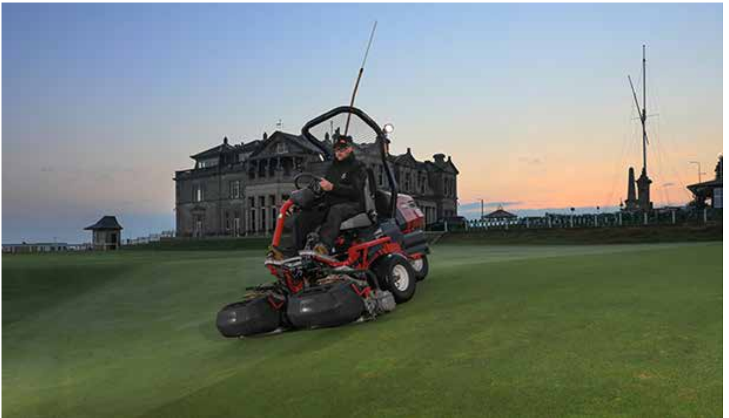
St. Andrews Links

Toro has worked with St Andrews, the Home of Golf, since 1999. St Andrews' seven golf courses currently use Toro® hybrid and all-electric equipment to help reduce emissions, as well as Toro Lynx® Central Control System to reduce water usage and create best-in-class turf conditions.