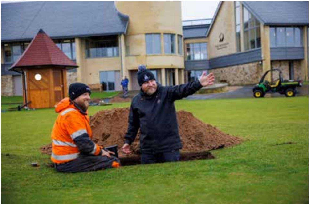
Rain Bird work at Carnoustie

Subscribe to Rain Bird 360: https://360.rainbird.com/